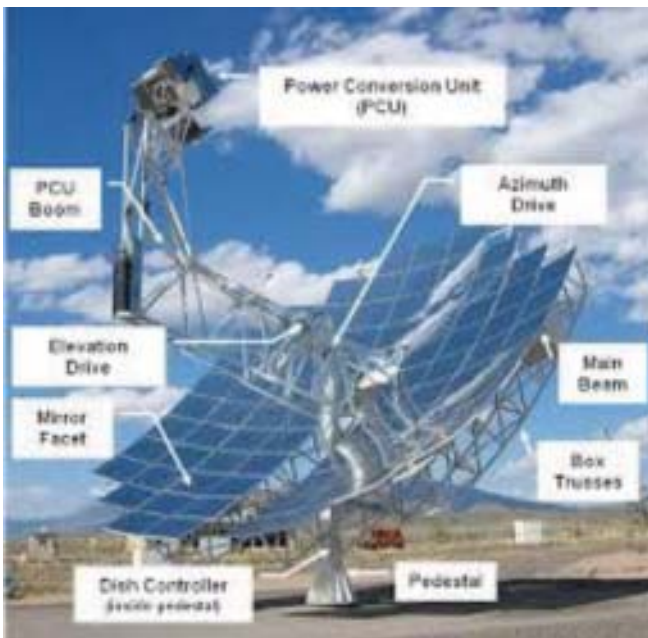
Fig.2. Dish stirling systems