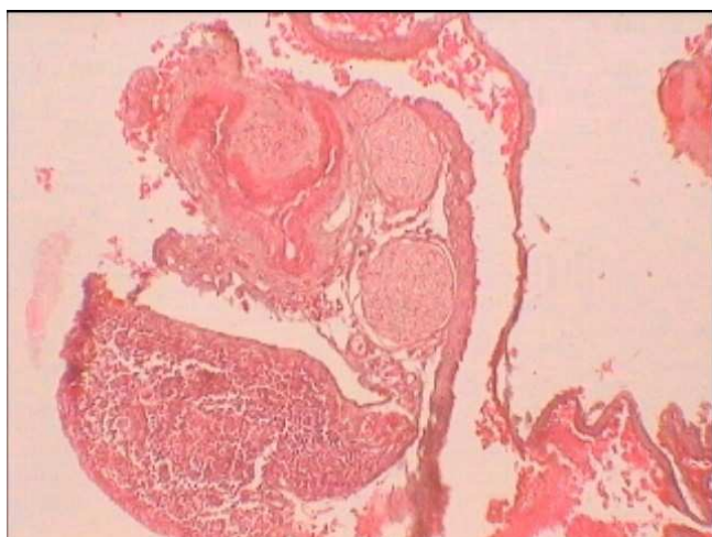
Fig. 2b. Regressed and inactive thymus during breeding phase. x100.

androgen rhythm in the spiny-tailed lizard was studied by Arslan et al. (1978). According to Bourne et al. (1986), an annual cycle of plasma and testicular androgens exists in the lizard Tiliqua rogosa . According to Lofts et al. (1966), there is a seasonal pattern in the testis of cobra Naja naja . The present data indicate that in Calotes versicolor the plasma testosterone level begins to rise in March and reaches the highest in June. This rise in plasma testosterone concentration coincides with enhanced testicular weight, active spermatogenesis and appearance of mature spermatozoa in the testis. Arslan et al. (1978) observed a similar annual androgen rhythm, which affects the testicular weight and spermatogenic cycle. According to Callard et al. (1976), peripheral testosterone level influences the development of interstitial cells and the seminiferous epithelium.