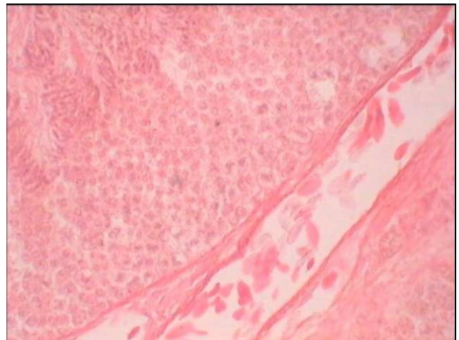
Fig 2 a. Active testis with well-developed seminiferous tubules and other tissues during breeding phase. x400

of Hassall in the medullary lobules were distinct. The lymphocytes were densely packed in the inner medulla. The thymus regressed during April to September and the cells were cord-like during peak of the breeding phase. From October onwards the thymus increased in size and remained well-developed up to February (Fig. 1b, 2b). The histological observations were thus indicative of an opposing trend between testis and thymus.