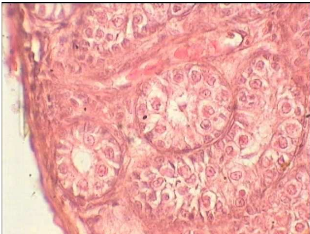
Fig. 1a. Inactive testis during non-breeding phase showing regressed seminiferous tubules. x400.

The body weight and testis weight of Calotes versicolor during the one year period of study are presented in the table 1. The weight of the testis began to increase significantly in March and reached the peak in June, which coincided with the onset of breeding phase. The weight was maintained closer to this level throughout the breeding phase, which extends from July to September, when the seminiferous tubules were well developed and produced spermatozoa. The interstitial cells were prominent. From October onwards the weight of the testis decreased (Fig. 1a, 2a)