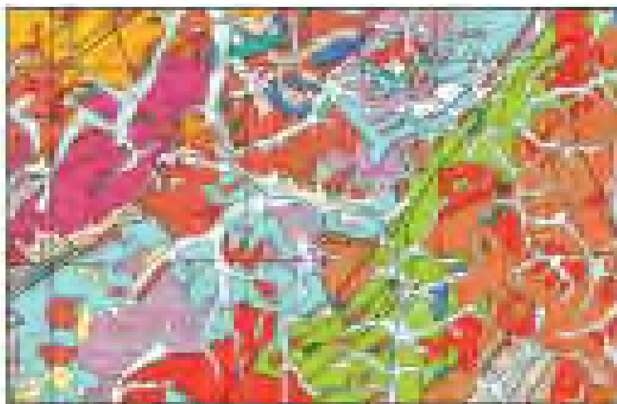
Fig.1 Regional geology of Bayangol terrain

According to the respective external environment and the characteristics of different functional zones, using the method of diagonal points collect soil samples, each sample area select 10 sampling points, and in accordance with the 0~20cm and 20~40cm to layered soil profile collection, totally collect 80 samples. According to the CulterLs230 and main soil texture classification standards in China, the soil texture of the samples is distinguished. Takes samples back to the lab,