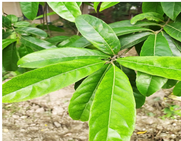
Figure 1. Elaeocarpus angustifolius Blume tree and leaves.