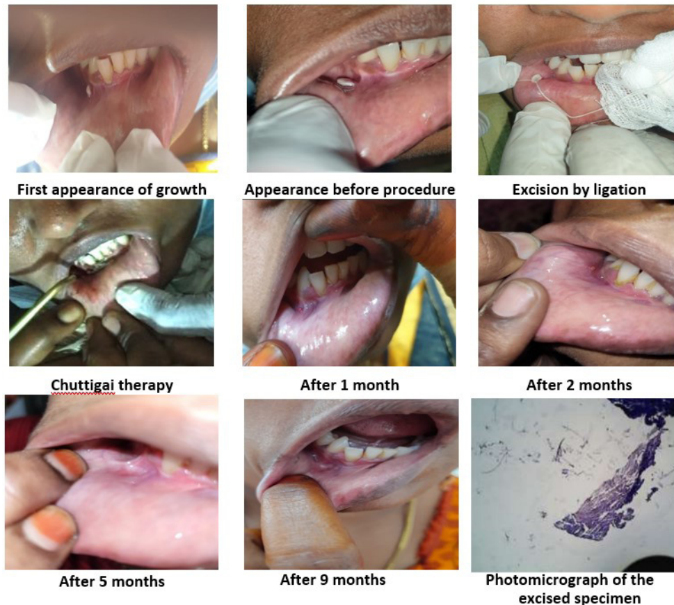
Figure 2. Treatment photos and histopathological photomicrograph.