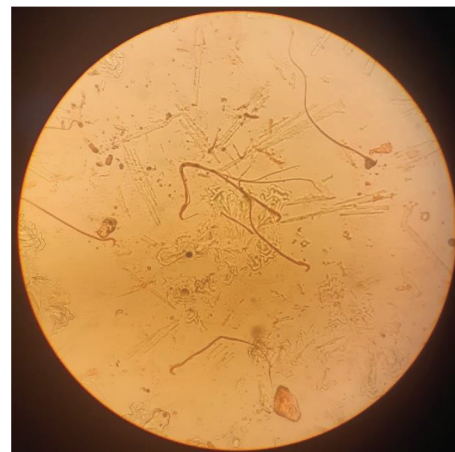
Supplementary Figure 2. The sperm motility under high power field (10x) (original).