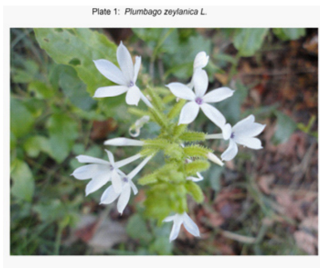
Figure 2. Plumbago zeylanica L.

specimen (No: XCH: 28076-28080) was deposited at the St. Xavier’s College Herbarium (XCH), Palayamkottai, Tamilnadu.